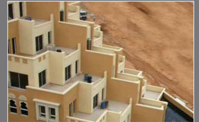
Terrace & Balconies